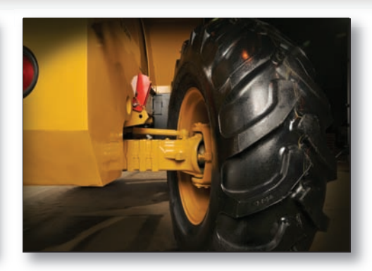
STEERING CONTROL: Tight turning radius with exceptional ground clearance.