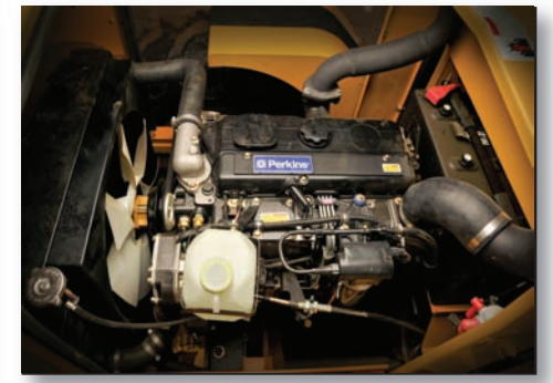
ENGINE: The P Series forklifts have a sliding hood for easy access during maintenace, and house a Perkins Turbo Tier 3 emissions compliant diesel engine.