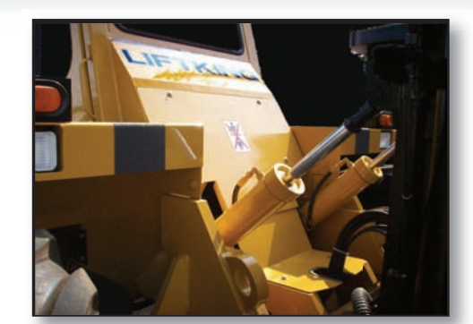
PROTECTION: Fully enclosed and protected electric and hydraulic systems.